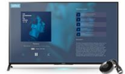
Qobuz with Chromecast