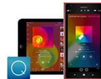
Qobuz for smartphone iOs, Android, Windows Phone, Amazon